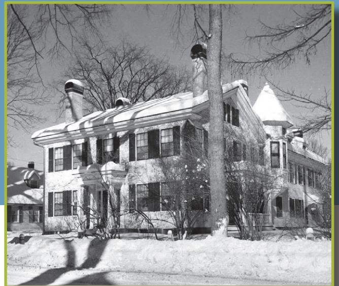
OHF offices at Simmons House, 30 Pleasant Street, Woodstock, VT

Contact Us: 802.457.4188 info@ohfvt.org www.ohfvt.org