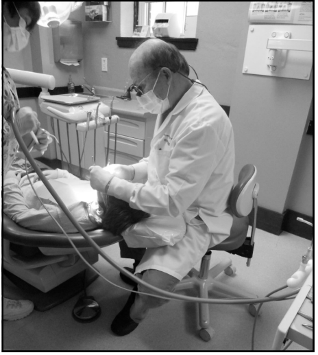
Organizational Grant Recipient: Red Logan Dental Clinic

In 2011, the Foundation funded 1.) Organizational Grants, 2.) Good Neighbor Grants, 3.) Irene related grants, and 4.) Loan Forgiveness Grants. OHF made 28 organizational grants of $861,945 to 20 different agencies addressing health needs in our community. An additional $40,400 in Irene related grants was made.